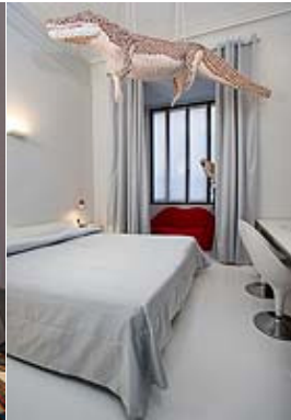
Nicola Bolla room