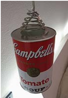
Nicola Bolla room