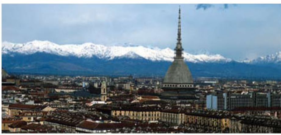
FAR LEFT Panoramic view of Turin. BELOW The Duomo, home of the Turin Shroud